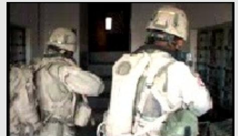
Rooftop Firefight in Tal Afar