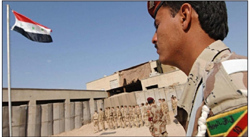
The Iraqi flag is raised in the Old State Building as the Iraqi Army takes over control of the building from coalition forces.