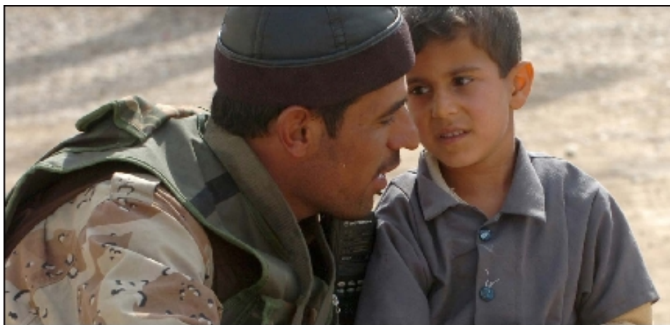
An Iraqi Army Soldier makes friends with an Iraqi boy during a foot patrol near the village of Kem, Iraq. The boy rushed over to show the Soldier a fish he had caught.